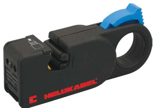
PROFINET® Cable Stripper Part No. 801497

Knife cartridges for other cable types or constructions