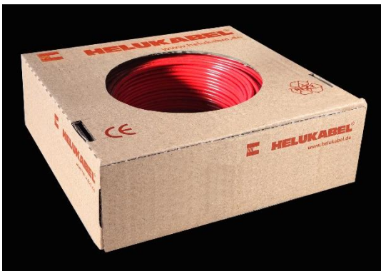
Bild 2: Smaller core diameters supplied by HELUKABEL also in practical 100-metre cardboard boxes. This facilitates handling and simplifies machine cabling. (Source: HELUKABEL)

Bild 1: HELUKABEL's FIVENORM single core cables are certified according to all common approvals such as VDE, CSA, EAC, UL and MTW and are therefore especially suitable for export-oriented machine and plant manufacturers. (Source: HELUKABEL)